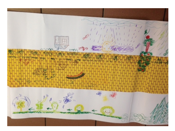
Figure 3. "Yellow brick road" reflective drawings